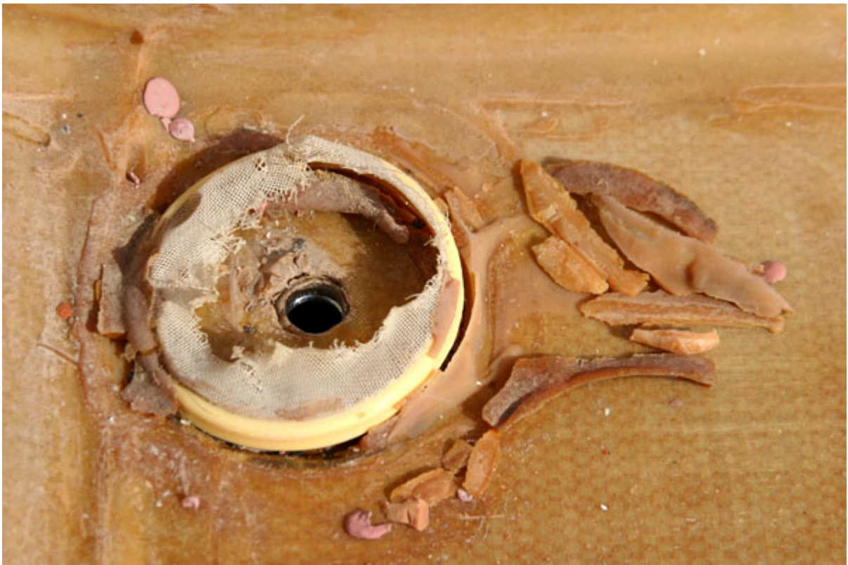
Figure 3: Debris and Strainer Disintegration