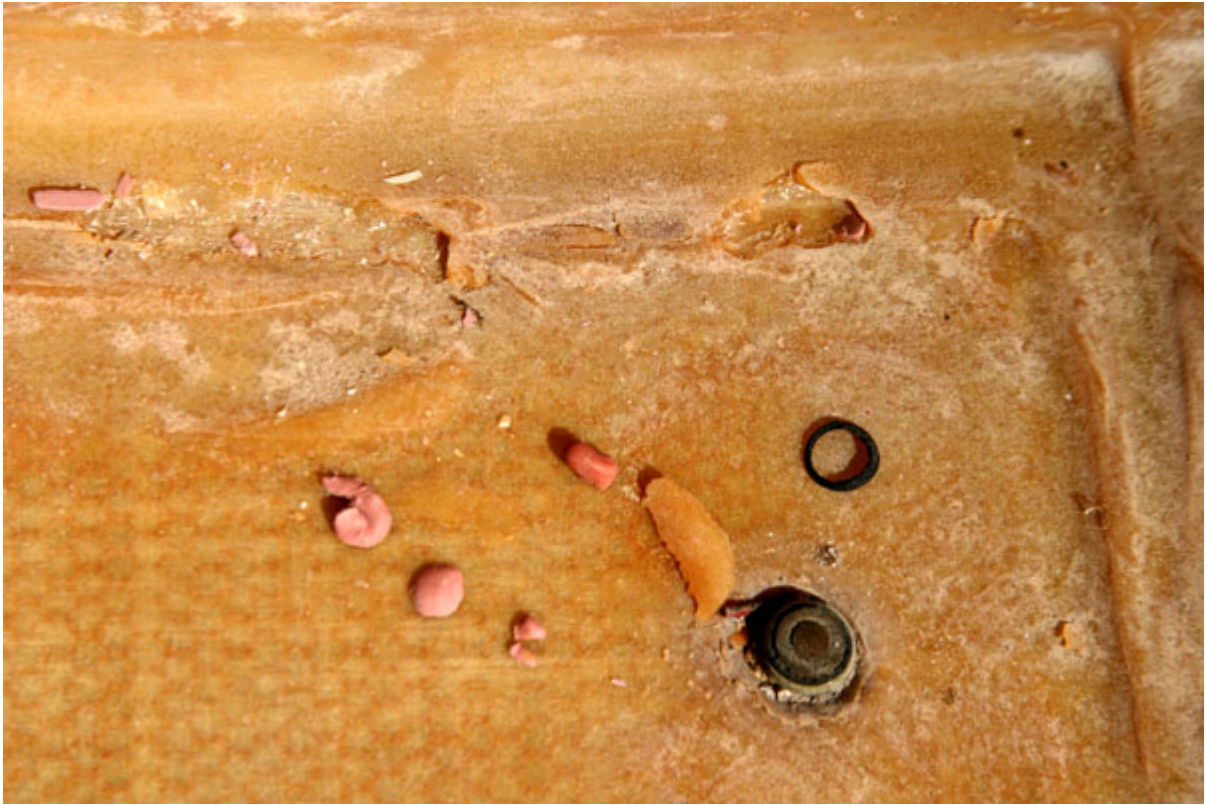
Figure 2: Debris and Deterioration of Edge Joint