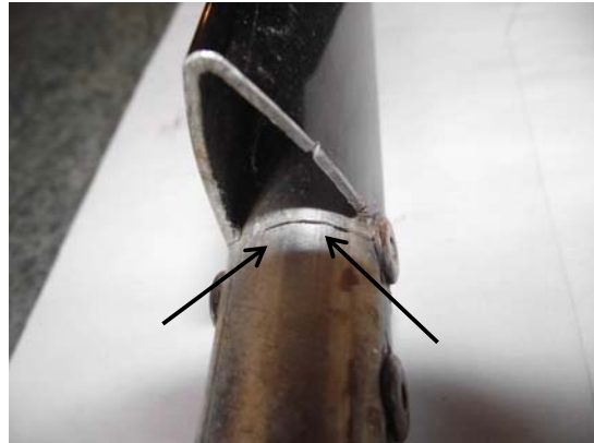
Figure 2: large crack on lift strut

Although the lift strut on this SSDR does not appear to be entirely standard, cracking has also been observed on a standard lift strut. See Figure 3.