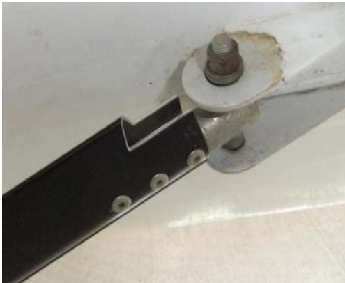
Figure 1: top of lift strut and wing attachment

A very serious crack was found in the top of a lift strut on a Shadow that is currently being operated as a single-seat deregulated (SSDR) Microlight. See Figure 2.